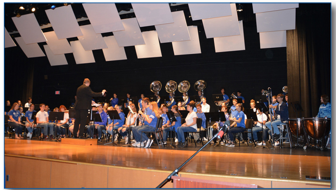
Above, below, and at left: Music students, cheerleaders, and PTO families came to the High School Auditorium September 3 to welcome staff to the new school year.