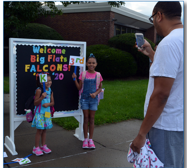
Above: A Big Flats dad takes photos of his daughters on the first day of school September 4. Below: First day of school at Ridge Road. Bottom, Middle School students enter school after getting off the bus September 4.