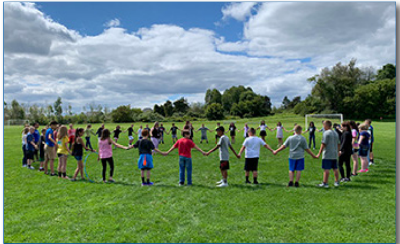
Intermediate School students participated in team building activities on a beautiful day September 5. See more first week of school photos on pages 2-3.

We look forward to a great 2019-20 school year.