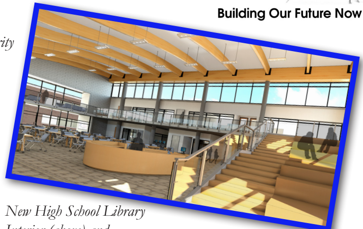
New High School Library Interior (above) and Exterior (below)