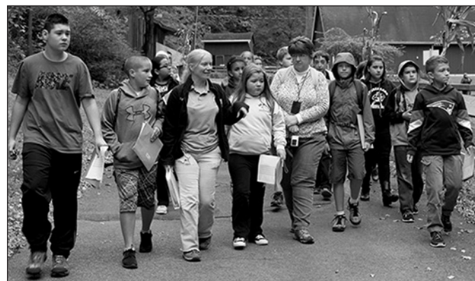
Intermediate School sixth-graders visit the Ross Park Zoo in October to learn more about the zoo and its operations.