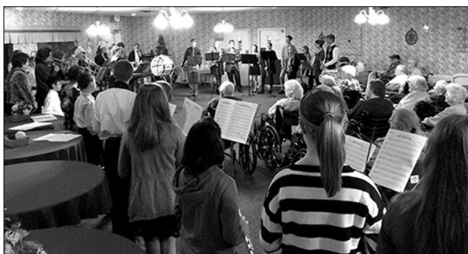
Music students perform at Absolute Care-Three Rivers Skilled Nursing December 7 as part of the Harmony Bridge program.

Horseheads is one of just five districts in the nation chosen to pilot the program.