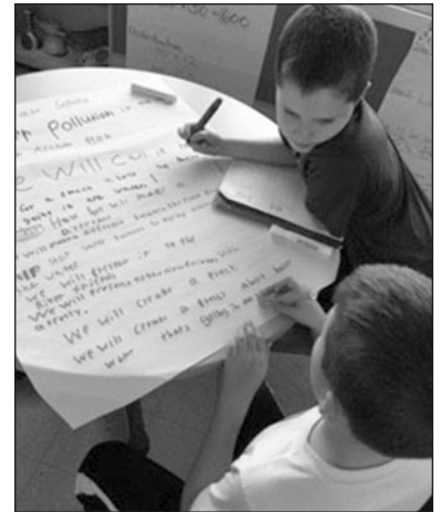
Gardner Road fourth-graders working on their human footprint project.

manager and everything that type of work entails. He also gave them advice for moving forward with their project.