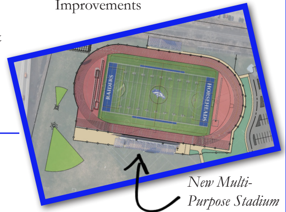
New Multi-Purpose Stadium