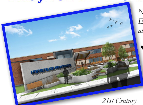
New Main Entrance & Security at High School