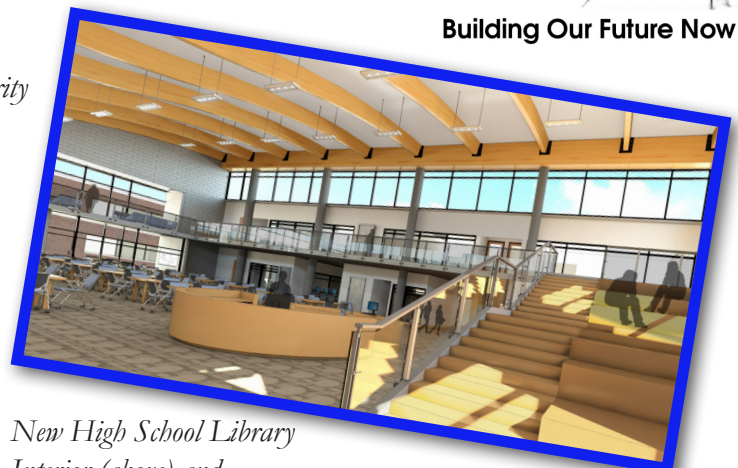
New High School Library Interior (above) and Exterior (below)