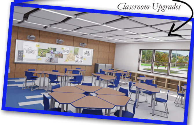
21st Century Classroom Upgrades