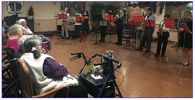
Above: Student musicians continue to perform and connect with senior citizens through the Harmony Bridge program. Here, students perform at Bethany Manor in Horseheads. Below: The High School Marching Band marches in the Horseheads Saint Patrick's Day Parade.