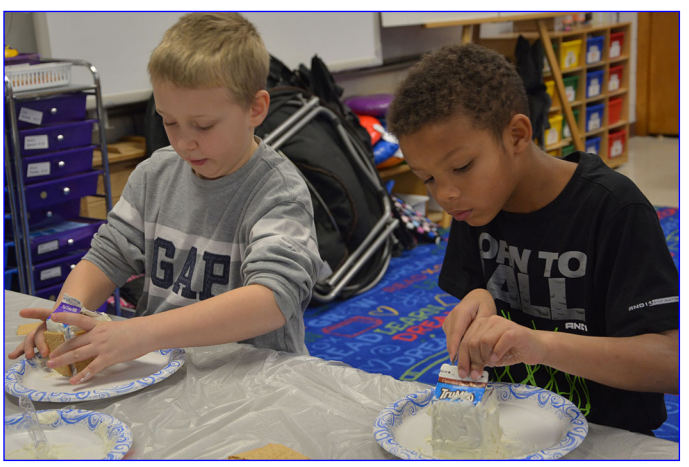
Center Street third-graders built gingerbread houses with graham crackers and frosting in December.