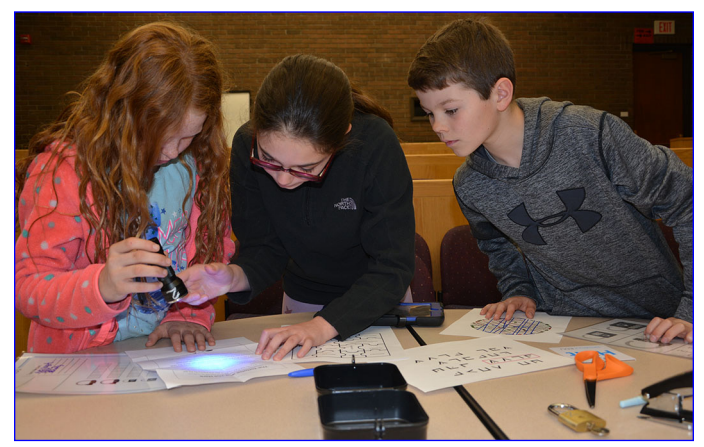
Fifth-graders use clues, teamwork, critical thinking, and persistence to crack codes and solve puzzles.