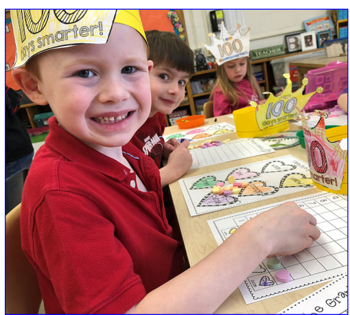
Kindergartners at Center Street mark the 100th day of school in February.

The state budget for fiscal year 2018-19 includes a 1.75% increase in total state aid to the district. The percentage of our budget funded by state aid is decreasing.