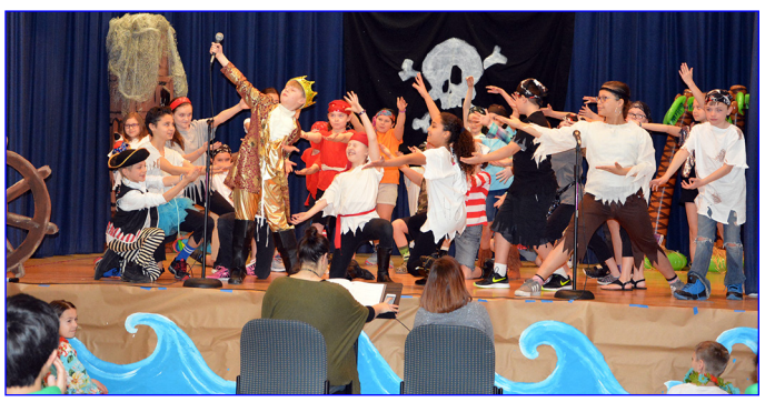
A scene from the Ridge Road fourth-grade play Pirates in March .