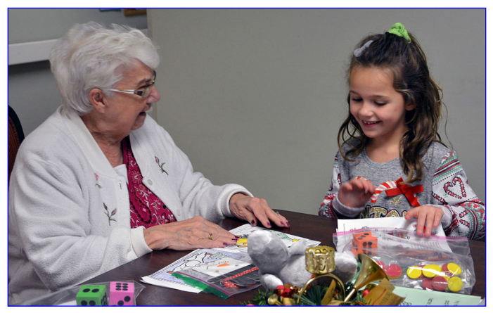
Students from Center Street and Ridge Road visited residents at Bethany Manor during the holidays.