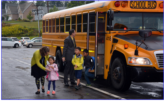
From the first day of school at Gardner Road (above) and at the High School (below).

The district will finance the purchase through a five-year serial bond. The state will reimburse a substantial portion of the cost in aid to the district in the five years following the expenditure.