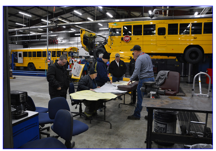
In December 2017, the district Transportation Department held a training for area firefighters and emergency personnel to learn more about bus safety and how buses work. More than 50 people representing 14 fire departments attended.

Learn more about the 2018-19 budget at www.horseheadsdistrict.com. Questions? Call 739-5601, x4260 or email <u>hcsdinfo@horseheadsdistrict.com</u>.