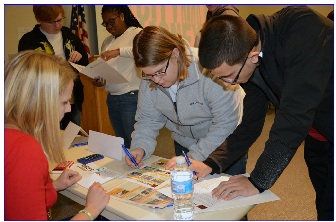
High School students learn about budgeting, bills, credit, and saving in the Mad City Money program, sponsored by Corning Credit Union with assistance from the Career Development Council. Students are given a career and salary, and they must visit each table, where volunteers act as salespeople to help them budget for necessities such as housing, food, and clothing.

Other revenue of $2.6 million includes Medicaid and Medicare reimbursements, BOCES refund, interest, rental income, donations and gifts, and gate receipts.