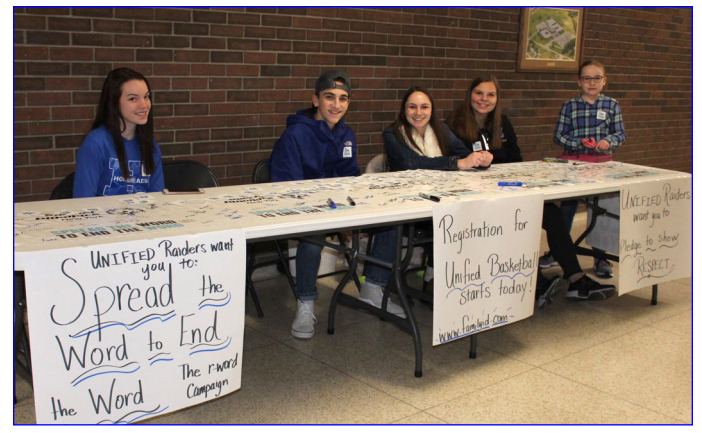
Unified Sports, a program of Special Olympics, combines athletes with and without intellectual disabilities on sports teams for training and competition. The High School's team, Unified Raiders, is currently in their inaugural basketball season. The team plays May 15 at 4:30 p.m. in Elmira, May 17 at 4:30 p.m. at home, May 24 at 4:30 p.m. at Johnson City, and a season-ending celebration May 30.