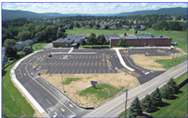
During the summer, the entire parking area at Gardner Road Elementary School was replaced, and traffic patterns were changed to separate bus traffic from car traffic.

Due to the weather this summer, portions of the roofing projects across the district could not be completed. These will be completed next spring. The district will revisit additional work on elementary buildings in the last phase of the project.