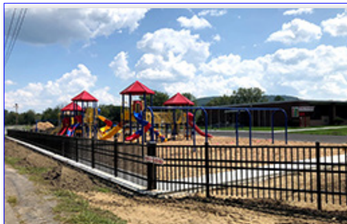
During the summer, playgrounds were replaced at Ridge Road, and a high-impact safety fence was installed at the corner of Ridge and Wygant roads.

For more background on the capital improvement project, click here.