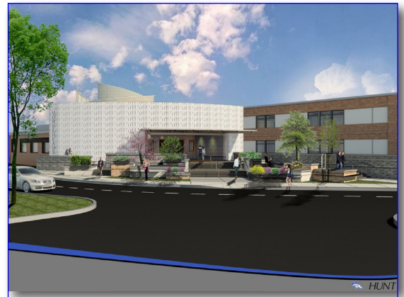
New architects' rendering of the main entrance at the High School.

At the October 18 Board of Education meeting, representatives from Hunt Architects, Engineers, and Surveyors and Welliver Construction reported to the board on the status of the district-wide capital improvement project.