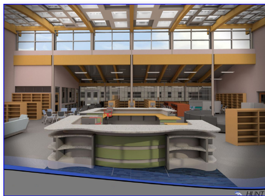
New architects' renderings of the cafeteria and library at the High School.