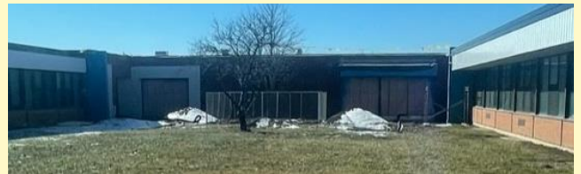
B wing and C wing are now connected with brickwork coming to completion. We now have a courtyard.