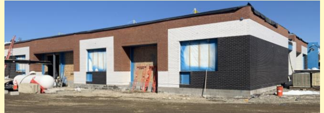
The new addition looking from the swings on the k/1 st playground. Windows are coming soon.