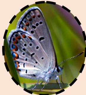
Karner Blue Butterfly