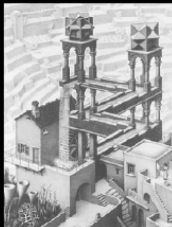
WATERFALL (1961) MC ESCHER

GET ALL THE DETAILS AND ENTRY FORM AT http://go.gstric.org/406-contest