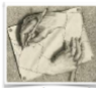
Drawing Hands MC Escher (1948)

Talking to Kids About the Violence at the U.S. Capitol - http://go.gstric.org/406-capitol