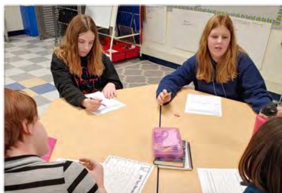
Bradford sixth grade students discuss their digital impressions