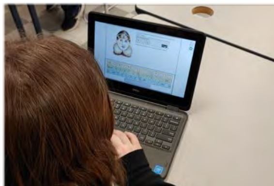
Bradford fifth grade students work independently on KWT