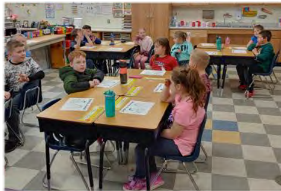
Bradford second grade students discuss "strange" online scenarios

More information about Keyboarding Without Tears at http://go.gstric.org/308-KWT