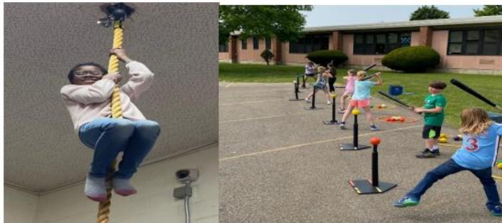
JUNE UNITS: Baseball/Softball skills - Field Day Preparation

Enjoy your summer break, continue to stay active, and ALWAYS remember: