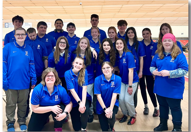
The district had two Unified Bowling teams who competed during the winter season.

Visit www.horseheadsdistrict.com/HCSDBudget2024-25.cfm for more information.