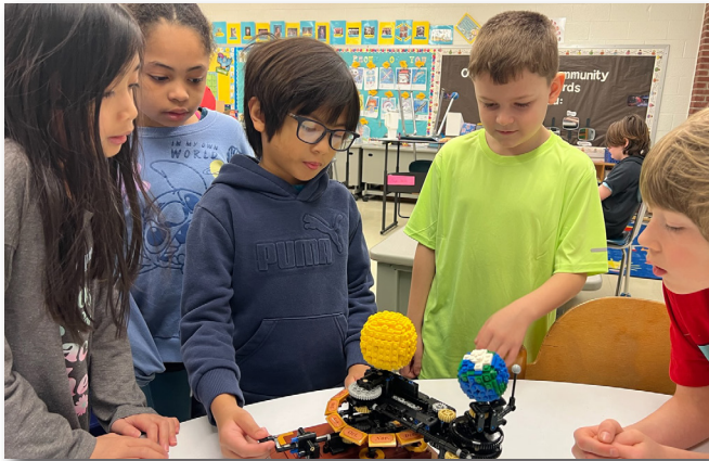
Students across the district prepared for the Great American Solar Eclipse through various lessons, including the use of models to explore how a moon makes a shadow during an eclipse and the path the eclipse will take.