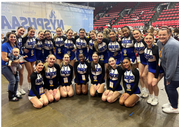
The Varsity Cheerleading team finished third in Class B at the NYS PHSA A Cheerleading Championship, with zero deductions.