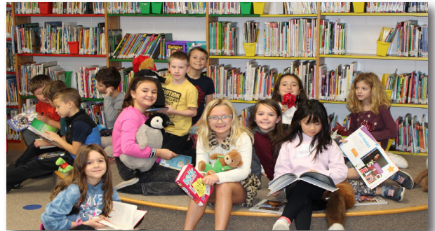
Third graders at Gardner Road Elementary School spend time reading in the Library.