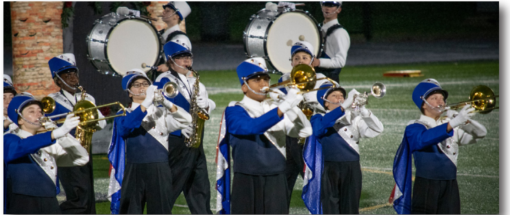
Above: The High School Marching Band performs during homecoming. Below: The High School Greenroom Players presented "The SpongeBob Musical" in March.

Non-Profit Org. U.S. Postage PAID Permit #5 Elmira, NY