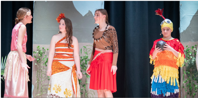
Middle School students performed Disney's "Moana JR." in March as their spring musical.

The proposed budget includes $2 million in debt service funds, $1 million of fund balance, $700,000 from appropriated reserves, and $170,000 interfund transfers. Other revenue of $2.6 million includes Medicaid and Medicare reimbursements, BOCES refund, interest, admissions, rental income, and donations and gifts.