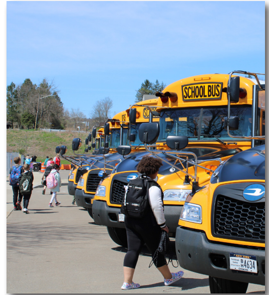
Currently, the district has 74 buses and six other student transportation vehicles.

Maintaining a replacement schedule allows the district to keep its bus fleet in good working order, minimizing maintenance needs. The district's Transportation Department has a current bus inspection passing rate of 98.7% as a result of the regular care they take in maintaining buses while minimizing costs.