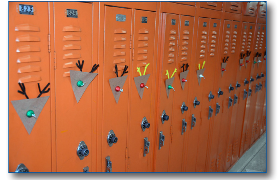
found a treat on their lockers - a reindeer with a chocolate nose and a positive message written on the back.