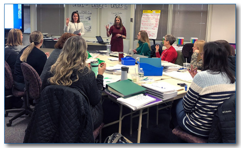
Elementary teachers and staff working on strategies for teaching phonics.

The district's curriculum development timeline is aligned to district needs and the New York State Next