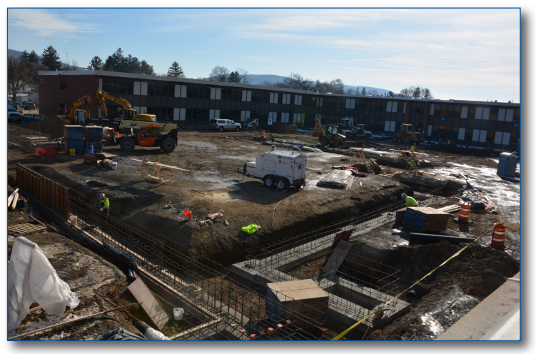
corridors to improve student traffic flow.

The completed work in the first two portions included a new parking lot at Gardner Road, new playground and security fence at Ridge Road, new roof at Big Flats and Center Street, and significant district-wide technology improvements in the areas of instructional technology, district communication View of 'the quad' at the High School, with construction of the new library and systems, and security technology.