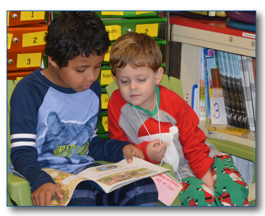
Left and below: Center Street students spent time with their buddies on the last day of school before winter break December 20.

Breakout box and other activities are being used in classes across the district to help students improve and test their skills and knowledge.