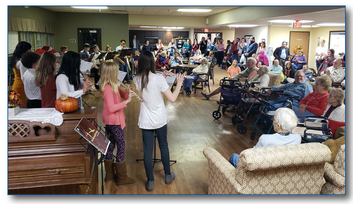
Our grade 6-12 music students continue to participate in the Harmony Bridge program, a national project that connects student musicians with senior residences. Here, students play for residents at Brookdale Senior Living in Painted Post in November. After they perform, the students spend time in conversation with the residents. Groups have performed at residences across our region. Horseheads was one of five districts chosen to pilot the program in 2015.