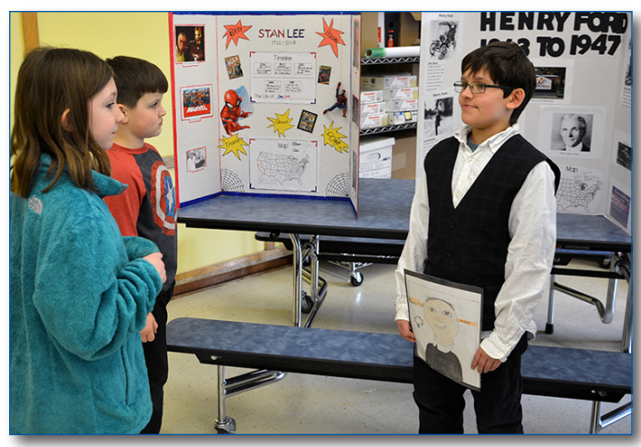
The Grade 3 Wax Museum is a tradition at Ridge Road. Students have researched a famous or influential person. At the wax museum during the afternoon on February 19-21, they portrayed that person for their fellow students, as well as teachers, staff, and parents.