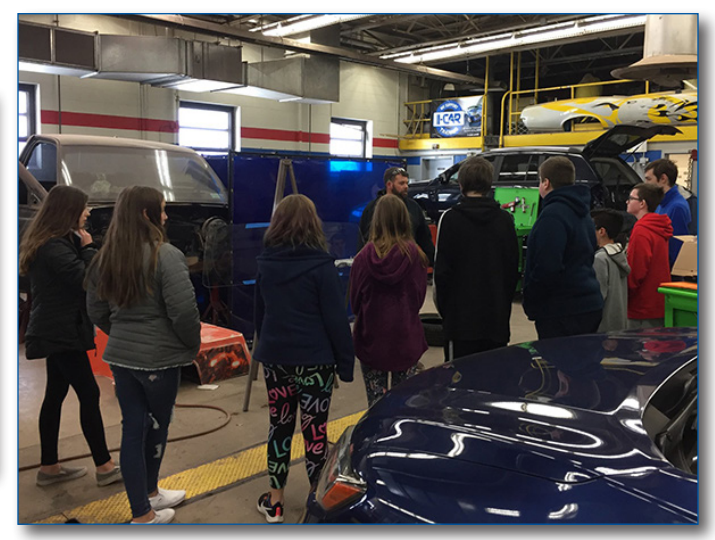
Eighth-graders toured the GST BOCES Bush Campus January 9 to see Career and Technical Education (CTE) programs in action. Small groups of students visited four CTE classrooms to see firsthand what the students learn, do, and experience. The tour highlighted BOCES' emphasis on hands on learning, the value of learning a skill, and how students can prepare to go directly into the workforce after graduation. The Career Development Council coordinated the tour.