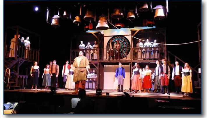
The High School Greenroom Players presented 'The Hunchback of Notre Dame' March 5-7.